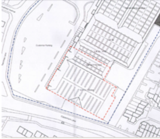
Existing site plan before subdivision by P/06651/075.